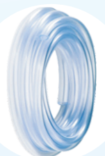
Wrinkle free tube