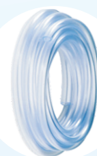
Wrinkle free tube