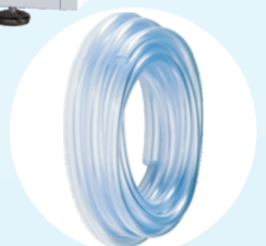
Wrinkle free tube

EFFICIENT LARGE CAPACITY COMPACT INDUSTRY HOMES STORES RESTORATION