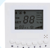
Optional Remote Control