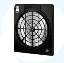
Optional Return Duct Kit