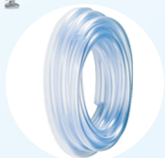
Wrinkle free tube