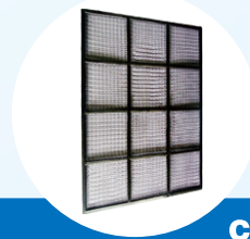
Clean Air Filter