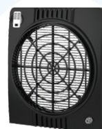
Return Duct Kit